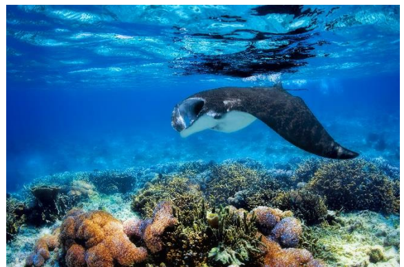
From top: Raja Ampat island, Spinner Dolphins, Manta Ray