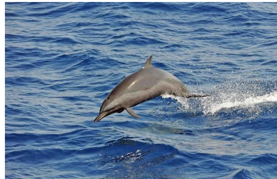
Spotted Dolphin